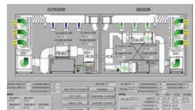
In-house developed software