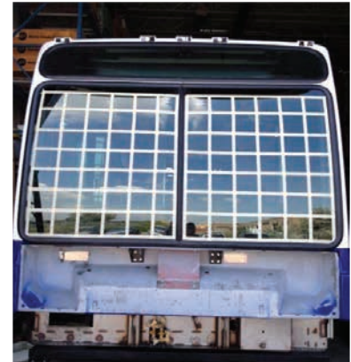
Windscreen Velocity Profile