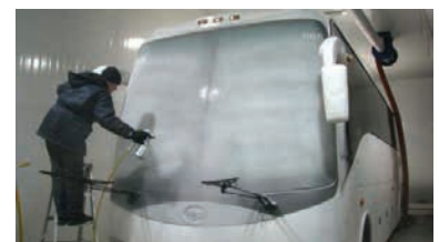
Defrosting Performance Test