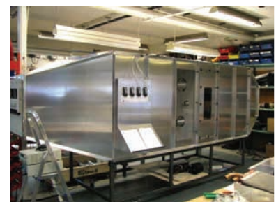
Airflow Test Cell