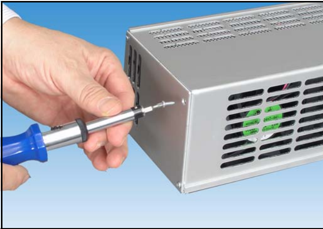
1. Remove the upper front screw from both ends.

Should entrance to the unit be required then it is easy to remove the cover.