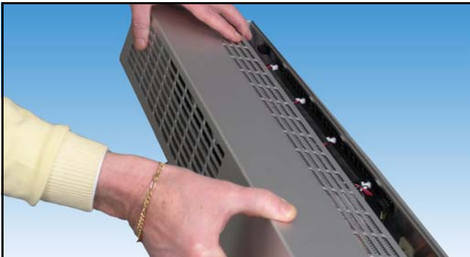
2. Remove first top then the bottom of the cover.