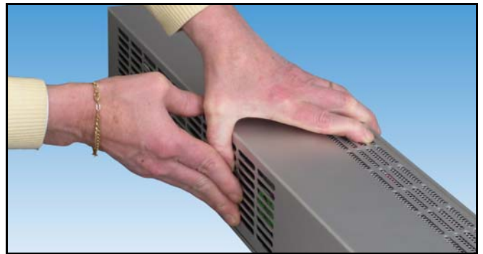
3. Place the cover in the groove, bottom first then the top.

UWE Verken AB Box 262 S-601 04 Norrköping, Sweden Phone +46 11 24 88 00 Fax +46 11 12 47 04 www.uwe.se