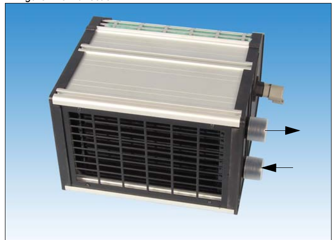
Figure: Flow direction